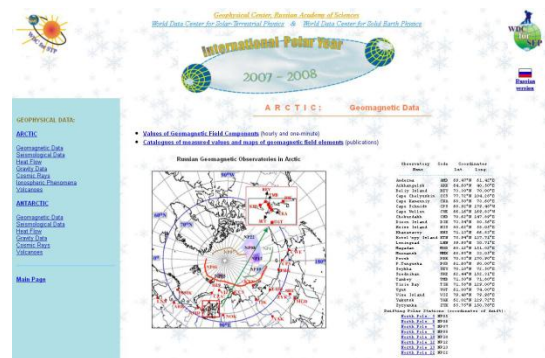
Figure 3. Access page to Arctic geomagnetic data of the IPY web site

“IPY Data and Information Service – IPYDIS”. The metadata circulate in a system of data gathering, storage, exchange, and processing at international and national levels.