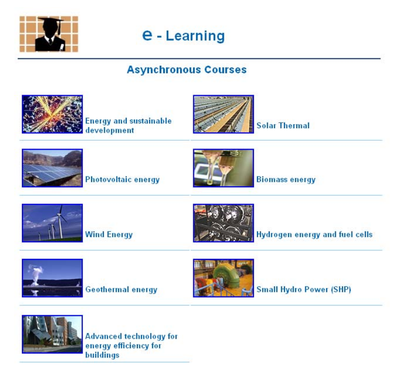
Figure 3. DESIRE-net e-learning courses