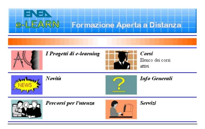
Figure 1 shows the home page of ENEA's e-learning platform (http://odl.casaccia.enea.it).