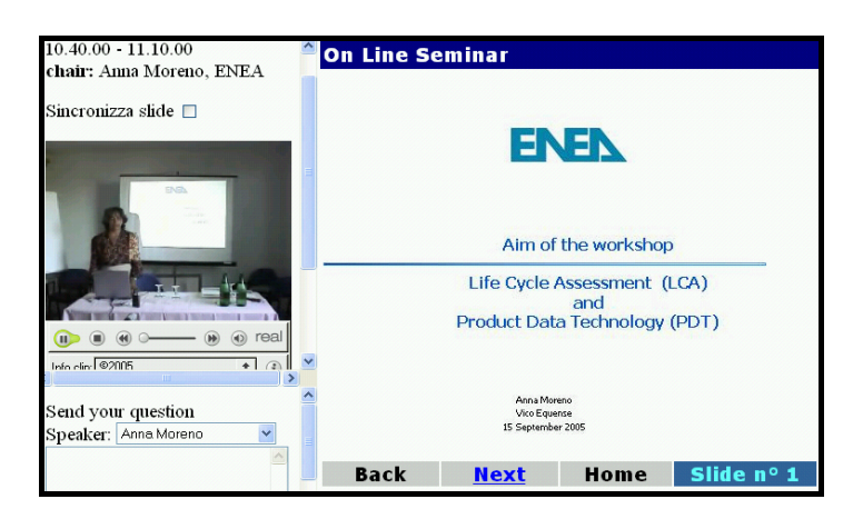
Figure 5. an example of a ENEA web seminar

Examples of these web lessons can be seen at the following web address but only after a free compulsory "user registration" <a href="http://192.107.71.126/alfa netseminar/">http://192.107.71.126/alfa netseminar/</a> (figure 5).