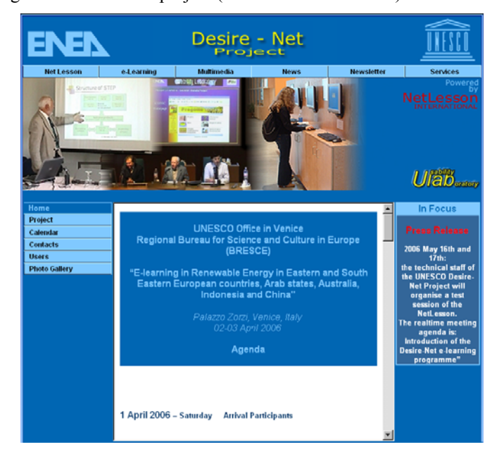
Figure 2 shows the home page of the desire-net project (www.desire-net.enea.it).