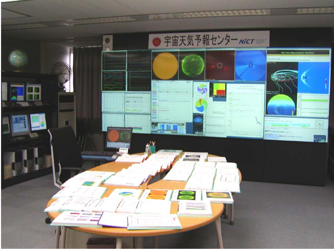
Figure 2. Space weather forecast center in the NICT.

Using the real-time data, it is possible to automatically detect occurrence of hazardous events and to deliver warning of space storms, such as arrival of solar energetic particles, occurrence of geomagnetic storms, enhancement of energetic electron at geosynchronous orbit, and so on.