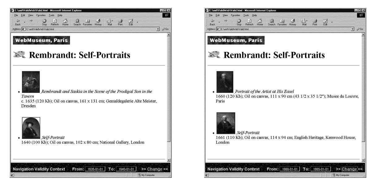
Figure 3: Temporal navigation of the Web Museum

supported by the Java Plug-in 1.2.2 (Sun Microsystems, 2002a).