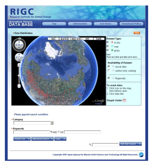
Figure 1. The top image of Cryosphere Data Archive Partnership (CrDAP)

development, the ground station meteorological data and photographic data were selected, and the structure of the metadata encompassing these data sets was determined. It functioned to archive datasets and metadata sets.