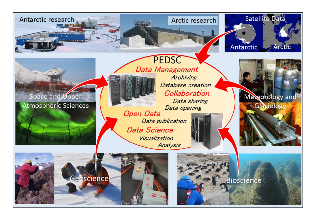
Figure 1 Conceptual figure showing the tasks of the PEDC to support polar science using the data obtained in both polar regions.

Kadokura et al. Data Science Journal DOI: https://doi. org/10.5334/dsj-2022-011