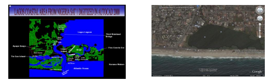
Figure 1. A map showing the geomorphology of the Lagos costal area, Nigeria (left) and an aerial photo of a lagoon (Kuramo Waters) in Lekki Peninsula (right). The aerial photo is taken from Google Maps.

and the Igbosere Creek are located to the east of this island. The Nigerian Coastline is bounded to the north by Five Cowries Creek and to the south by the Atlantic Ocean, where Tin Can and Apapa Port are located.