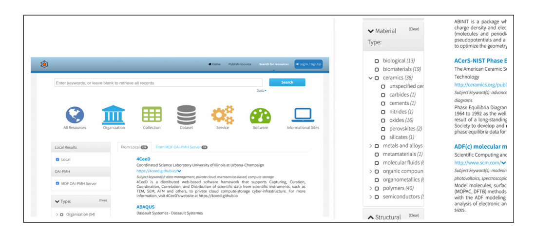
Figure 2 Registry search

Any researcher looking for data resources (e.g. repositories of DFT calculations) can visit the website, access the search page, submit simple keyword-based search queries, and receive back a listing of matching resources. The search results page provides faceted browsing of the results that leverages the controlled vocabulary. The user can drill down into subsets of results by clicking on different resource attributes and their categories. For example, the user can select particular resource types (like databases or software) that provide experimental data related to a topic of interest. Each search result includes a link to the resource's native landing page as provided by the data provider; thus, the user can now visit the resource's web site directly, download data or use the native tools provided by the data provider.