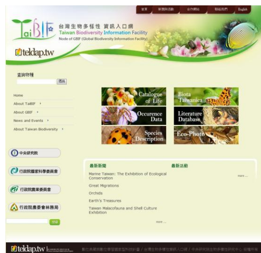
Figure 2. Homepage of TaiBIF

TaiBIF, the Taiwan node of GBIF, uses the metadata format and tools recommended by GBIF to integrate Taiwan's biodiversity information and share it with the global community. The homepage of TaiBIF is shown in Figure 2. TaiBIF consolidates various databases in Taiwan, including species checklists, Biota Taiwanica , species occurrence data, Taiwan Encyclopedia of Life, etc. Using biodiversity informatics and tools, TaiBIF enables the general public, academic scholars, and government agencies to gain access to the data on its platform. In addition, TaiBIF introduces international data standards and protocols so that it can meet the two objectives of "deepening Taiwan people's biodiversity knowledge" and "helping to make the world's biodiversity picture more complete."