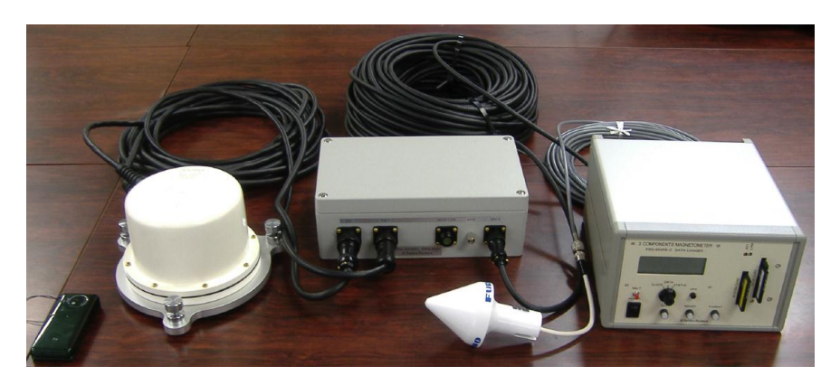
Figure 2. Current MAGDAS magnetometer system, called MAGDAS-9. This system consists of a data logging/transfer unit (right), a GPS antenna, a magnetometer main unit, a magnetic sensor, and a cellphone for reference (left), respectively. Total weight of items shown in this figure is 15.5kg. The type of geomagnetic sensor is that of a 3-axial components ring-core fluxgate. It has a \pm 70,000 nT/32bits dynamic range and a 0.01nT resolution. For more details, see our website, <a href="http://www.serc.kyushu-u.ac.jp/magdas/MAGDAS">http://www.serc.kyushu-u.ac.jp/magdas/MAGDAS</a> Project.htm.