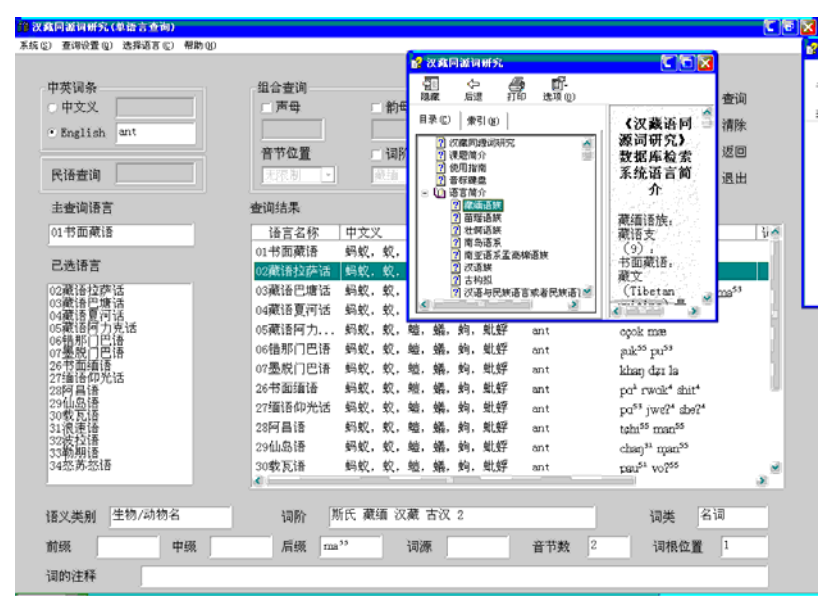
Figure 1. STDP homepage

Fourteen semantic and forty sub-semantic categories cover the cognition and expression for the whole world. The researcher can utilize the semantics classification to search the lexis.