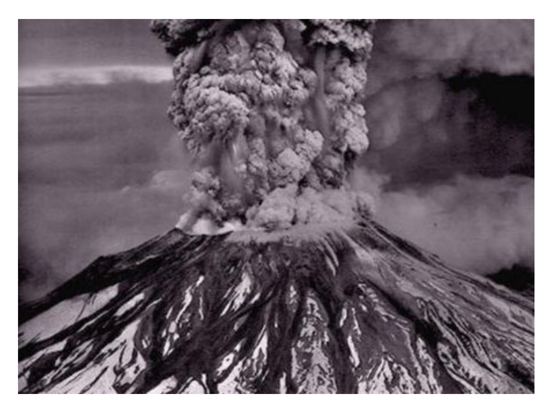
Figure 1. Mt. St. Helens Eruption Monitoring.