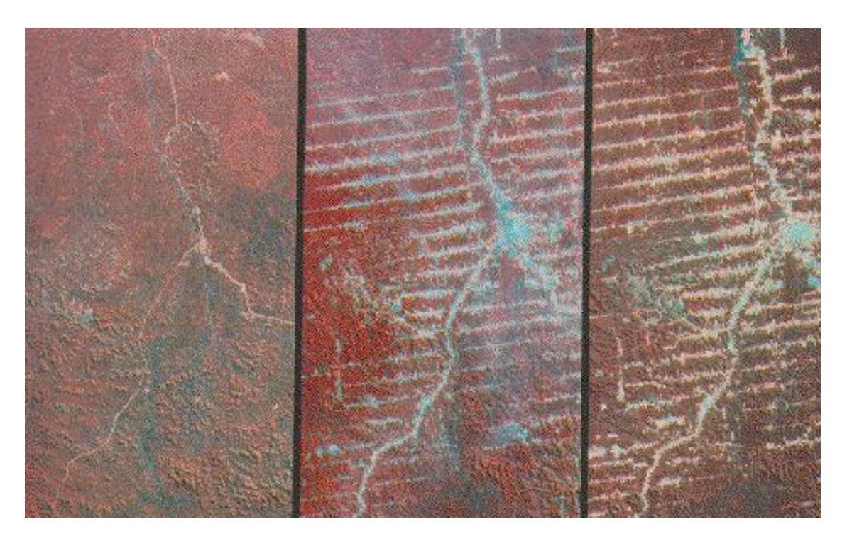
Figure 3. Brazilian Rainforest Change Analysis 1975, 1986, and 1992 (left to right).